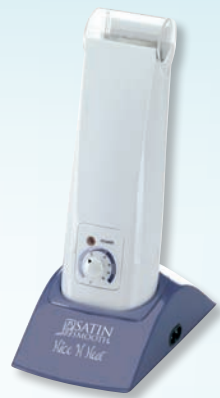
SSNNSW Satin Smooth® Nice 'N Neat™ Single Wax Warmer

Portable and convenient, this single cartridge wax warmer ensures superior results in minimal time. Specially designed to hold one large single wax cartridge, optimizing your waxing service. It also has a connection for another single warmer base, giving you options to customize your waxing services.