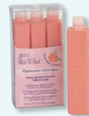
NNWR2CR Deluxe Cream Medium Replacement Cartridges Best for comfortably removing coarse and stubborn hair.