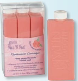
NNWRC4CR Deluxe Cream Large Replacement Cartridges Especially comfortable for African American and Latino clients.