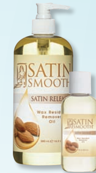
SSWL02 Satin Release® Residue Remover 16 oz. Easily removes post-depilatory wax residue while moisturizing skin.