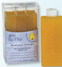
NNWRC4 Natural Wax Large Replacement Cartridges Maximize performance and minimize treatment time for normal to oily skin.

An innovative waxing system that uses wax-filled cartridges to improve performance and minimize service time. The ultimate convenience, this six-cartridge wax warmer heats 3 large and 3 medium cartridges in approximately 20 minutes.