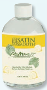
SSRMT11 Satin Cleanser® ReMoveIt Soak Solution 11 oz. Effortlessly removes wax residue when used with the ReMoveIt System.