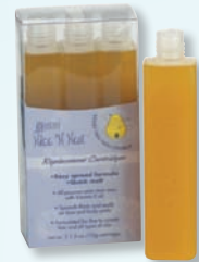
NNWRC2 Natural Wax Medium Replacement Cartridges Effective hair removal for clients with normal to oily skin.