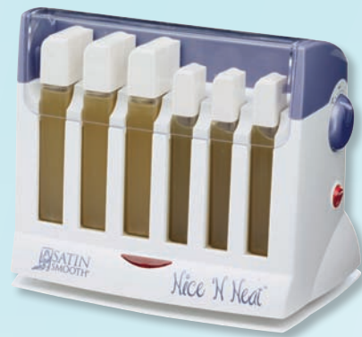
SSNNW6C Satin Smooth® Nice 'N Neat™ Cartridge Wax Warmer

Portable and convenient, this single cartridge wax warmer ensures superior results in minimal time. Specially designed to hold one large single wax cartridge, optimizing your waxing service. It also has a connection for another single warmer base, giving you options to customize your waxing services.