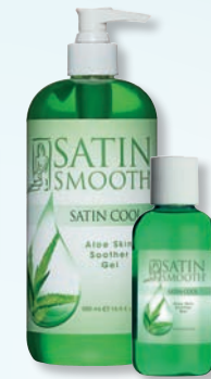
SSWL03 Satin Cool® Aloe Vera Skin Soother 16 oz. Soothing aloe helps reduce redness and irritation after waxing.