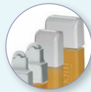
SSNNCRFL 3-Pack Fine Line Roller Heads Designed for easy eyebrow application.