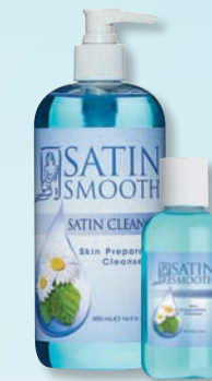
SSWL01 Satin Cleanser® Skin Preparation Cleanser 16 oz. Antiseptic cleanser opens pores for easy hair removal.