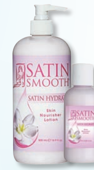
SSWL04 Satin Hydrate® Skin Nourisher 16 oz. Restores skin's natural balance after waxing.