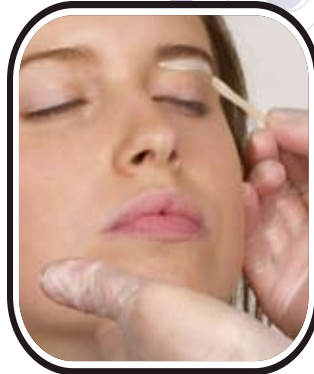
3. Apply wax with applicator