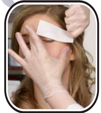
4. Wax with cloth strip