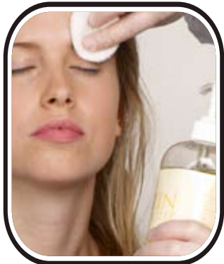
5. Apply Satin Cool & Satin Hydrate