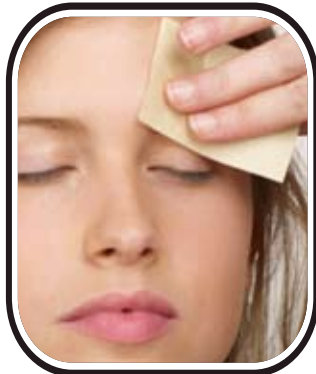
6. Blot with rice paper