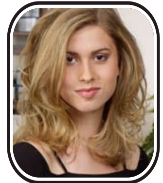
8. Beautiful in minutes