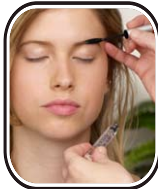
7. Touch Up